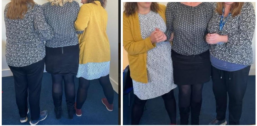
Reference: Double cup hold 5