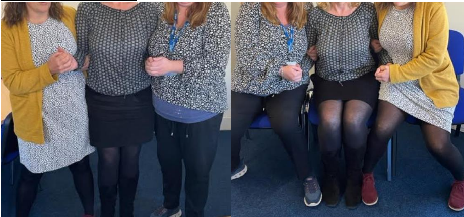
Reference: Seated rest position 7